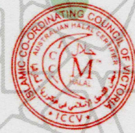
ICCV Halal Logo

ICCV is proudly accredited and recognised by: